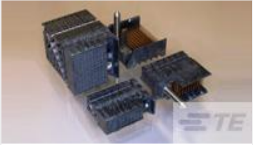
TE Part #2007705-1 IMP100S,R,RA3P10C,UG,39