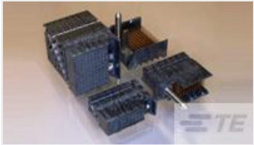
TE Part # 2007711-1 IMP100S,R,RA3P16C,UG,39

This information is provided based on reasonable inquiry of our suppliers and represents our current actual knowledge based on the information they provided. This information is subject to change. The part numbers that TE has identified as EU RoHS compliant have a maximum concentration of 0.1% by weight in homogenous materials for lead, hexavalent chromium, mercury, PBB, PBDE, DBP, BBP, DEHP, DIBP, and 0.01% for cadmium, or qualify for an exemption to these limits as defined in the Annexes of Directive 2011/65/EU (RoHS2). Finished electrical and electronic equipment products will be CE marked as required by Directive 2011/65/EU. Components may not be CE marked. Additionally, the part numbers that TE has identified as EU ELV compliant have a maximum concentration of 0.1% by weight in homogenous materials for lead, hexavalent chromium, and mercury, and 0.01% for cadmium, or qualify for an exemption to these limits as defined in the Annexes of Directive 2000/53/EC (ELV). Regarding the REACH Regulation, the information TE provides on SVHC in articles for this part number is based on the latest European Chemicals Agency (ECHA) ‘Guidance on requirements for substances in articles’ posted at this URL: https://echa.europa.eu/guidance-documents/guidance-on-reach