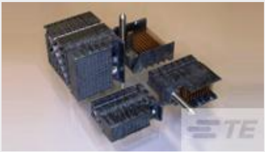
TE Part #2007717-1 IMP100S,R,RA4P10C,UG,39