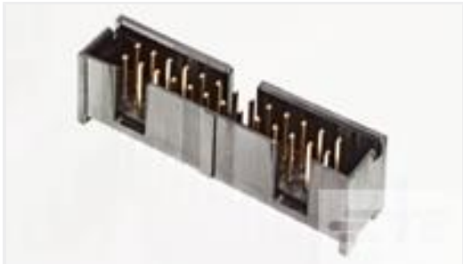
TE Part #5103308-2 A/L LOW PRO HDR 14P VERT BLACK