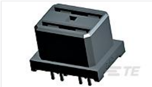
TE Part #2169806-1 IMP,Power,3PR,Vert,Recp,Tin