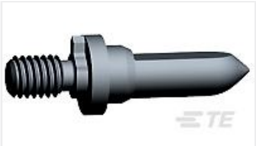
TE Part #2000676-1 Keyed Guide Pin, Machined, Vita 46