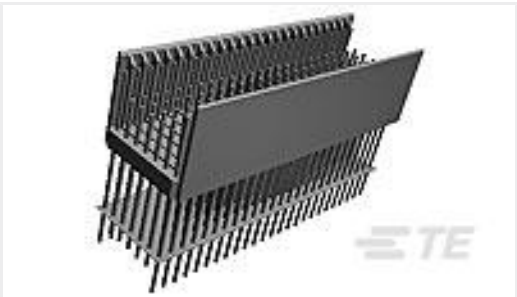
TE Part #5352869-1 2MMHM ASY,TYPE B 133 POS