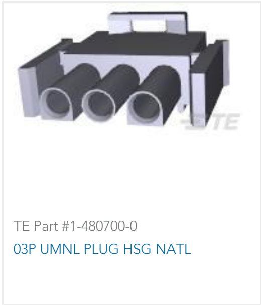
TE Part #1-480700-0 03P UMNL PLUG HSG NATL

1-1773865-2_1015_Commercial Manual Hand Tools