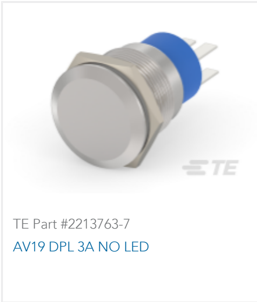
TE Part #2213763-7 AV19 DPL 3A NO LED