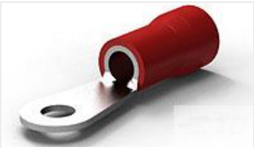
TE Part #52263-5 TERMINAL R PG 8 10