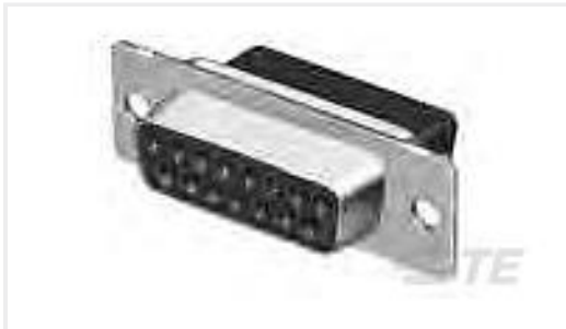
TE Part #205205-2 CRIMP SNAP RCPT ASSY,SIZE 2