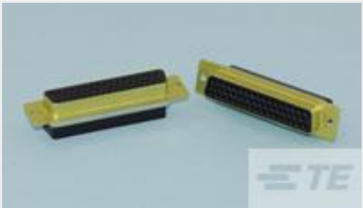
TE Part #1658640-1 HDP-20,RCPT,SIZE 5, 50 POSN