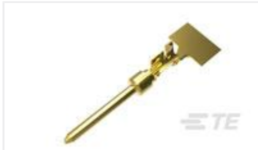
TE Part #66506-3 20 DF PIN