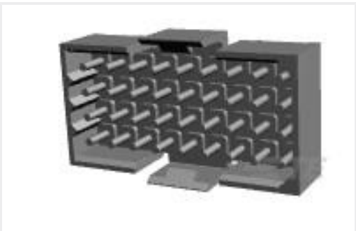
TE Part #1-207121-0 METRIMATE PIN HDR ASY,36P LF