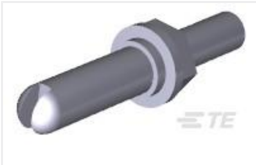
TE Part #1-200833-1 SERIES "M" GUIDE PIN ST. STL.