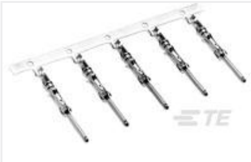
TE Part #66102-6 III+ PIN,24-20,30AU>10,STRIP