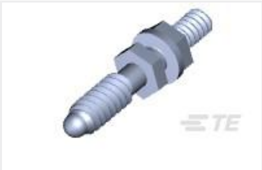
TE Part #1-200874-2 SERIES "M" JACKSCREW STUD ASSY