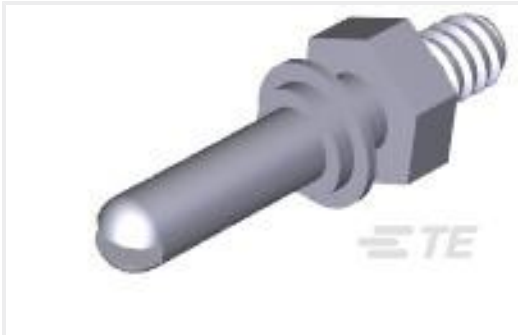
TE Part #1-201046-2 SERIES "M" MIN RECT GUIDE PIN