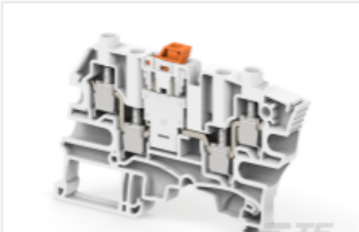
TE Part #1SNK506316R0000 ZS6-S-4S-T2