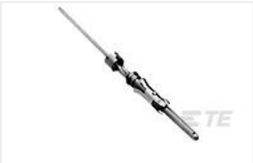
TE Part #66460-9 PIN,.062 DIA,.025 SQ POST,LP