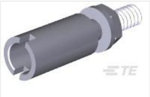
TE Part #1-200835-1 SERIES "M" MIN. RECT. GUIDE SOC