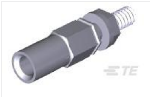
TE Part #200875-7 SKT ASSY,M SERIES