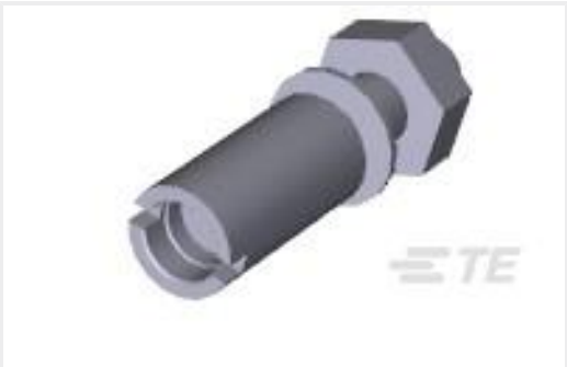
TE Part #201047-2 SERIES "M" ST. STL. GUIDE SOC.