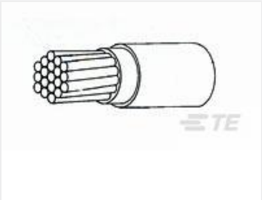
TE Part #2820313007 44A0111-22-1