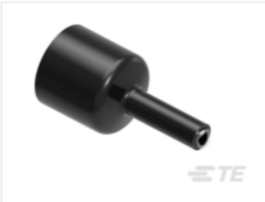
TE Part #NB07752001 HTAT-24/6-0-STK