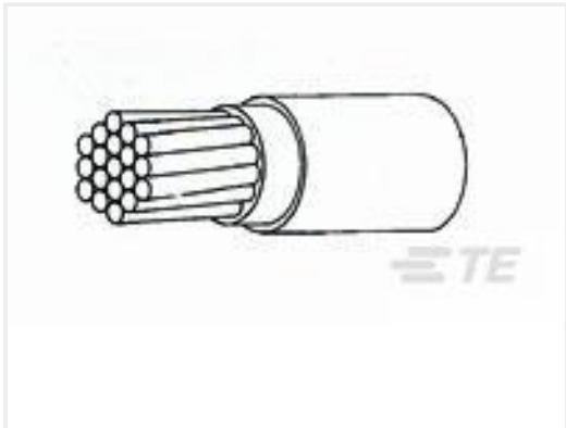
TE Part #2820353008 44A0111-22-5