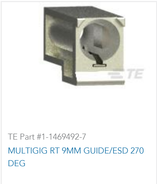
TE Part #1-1469492-7 MULTIGIG RT 9MM GUIDE/ESD 270 DEG