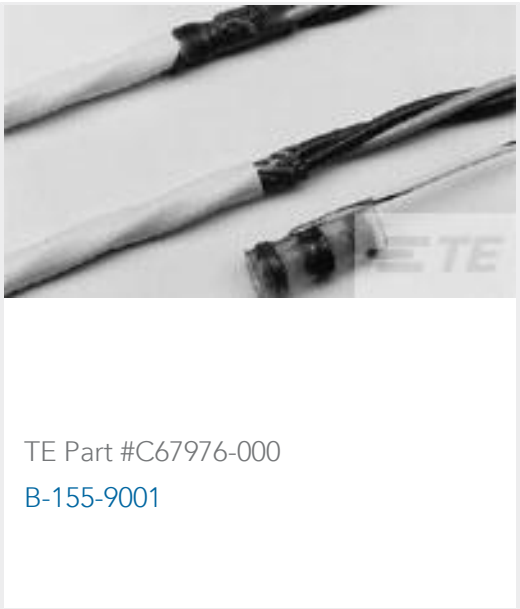
TE Part #C67976-000 B-155-9001