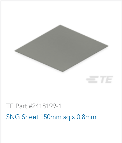
TE Part #2418199-1 SNG Sheet 150mm sq x 0.8mm