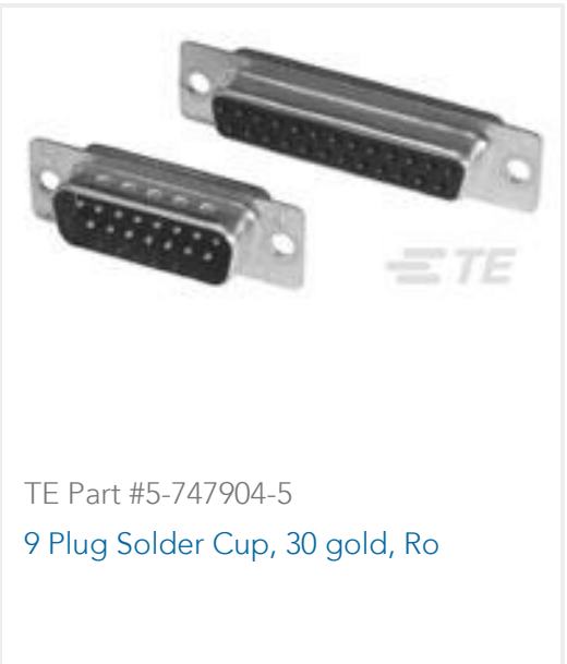
TE Part #5-747904-5 9 Plug Solder Cup, 30 gold, Ro