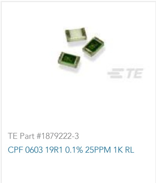
TE Part #1879222-3 CPF 0603 19R1 0.1% 25PPM 1K RL