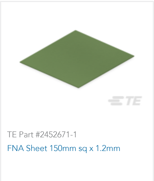
TE Part #2452671-1 FNA Sheet 150mm sq x 1.2mm