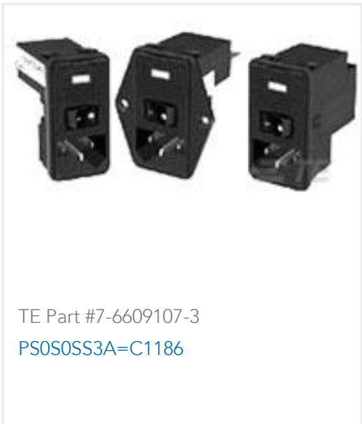
TE Part #7-6609107-3 PSOS0SS3A=C1186