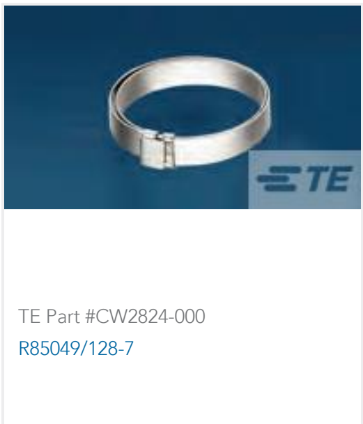
TE Part #CW2824-000 R85049/128-7