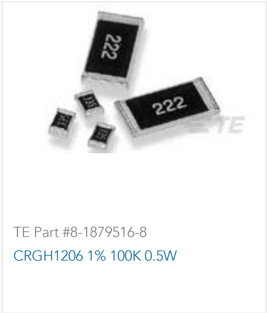
TE Part #8-1879516-8 CRGH1206 1% 100K 0.5W