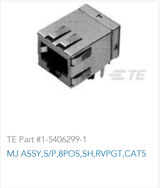
TE Part #1-5406299-1 MJ ASSY, S/P, 8POS, SH, RVPGT, CAT5