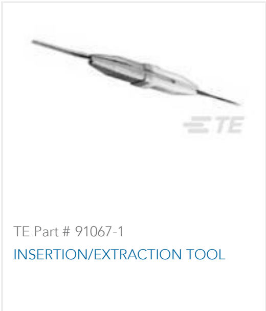
TE Part # 91067-1 INSERTION/EXTRACTION TOOL