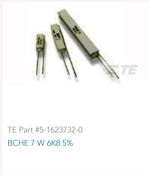
TE Part #5-1623732-0 BCHE 7 W 6K8 5%