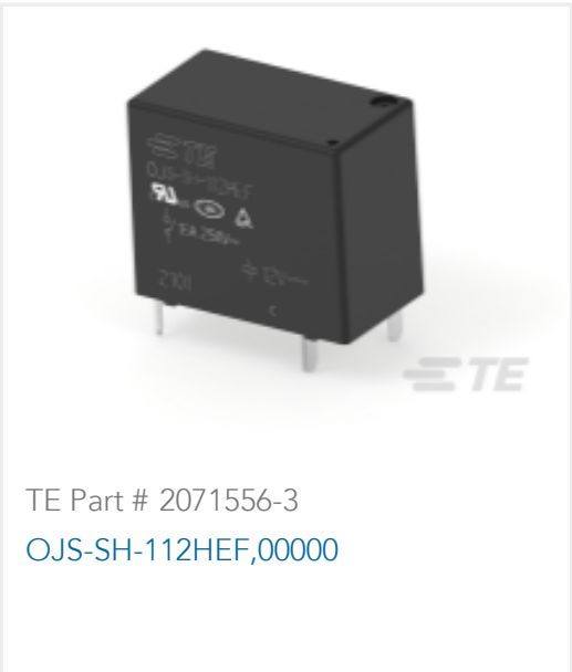
TE Part # 2071556-3 OJS-SH-112HEF,00000