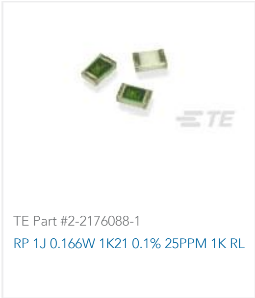
TE Part #2-2176088-1 RP 1J 0.166W 1K21 0.1% 25PPM 1K RL