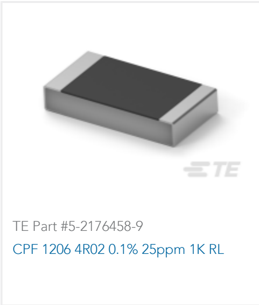
TE Part #5-2176458-9 CPF 1206 4R02 0.1% 25ppm 1K RL