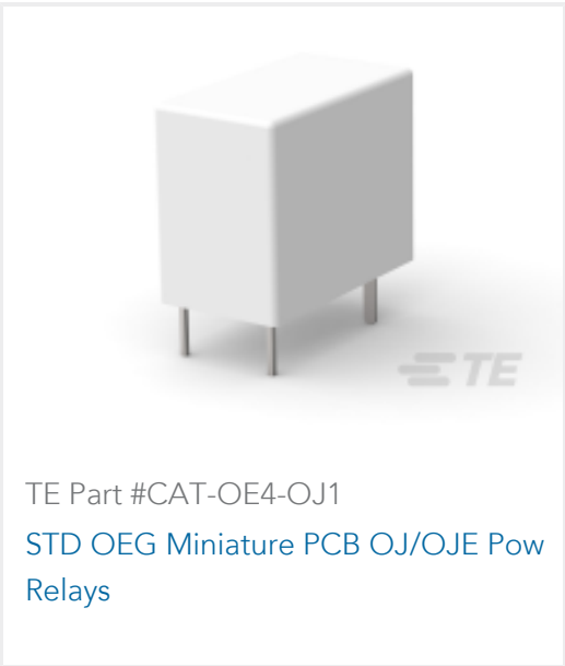
TE Part #CAT-OE4-OJ1 STD OEG Miniature PCB OJ/OJE Pow Relays