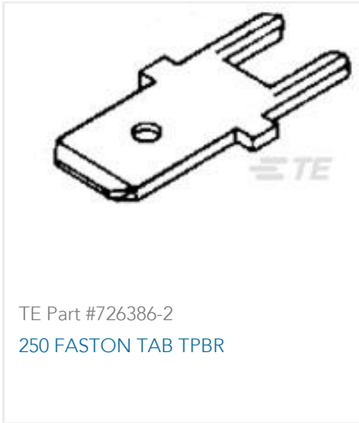
TE Part #726386-2 250 FASTON TAB TPBR