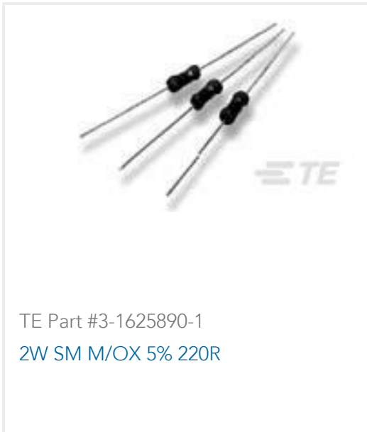
TE Part #3-1625890-1 2W SM M/OX 5% 220R