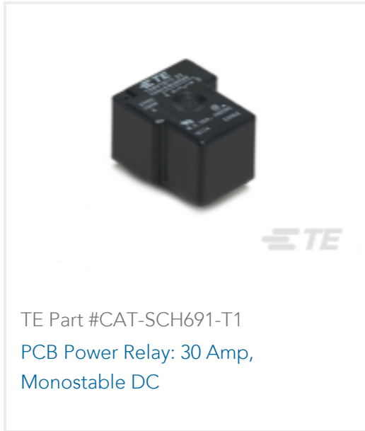
TE Part #CAT-SCH691-T1 PCB Power Relay: 30 Amp, Monostable DC