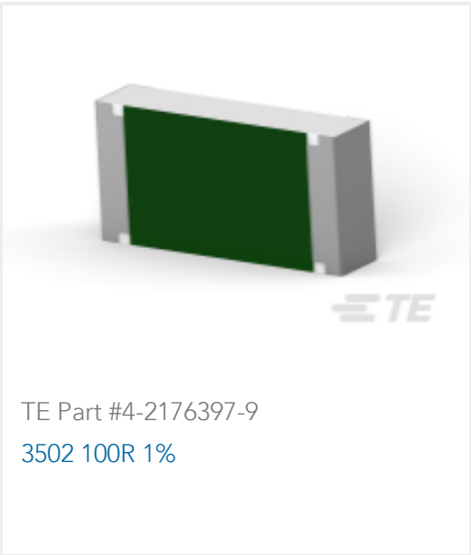
TE Part #4-2176397-9 3502 100R 1%