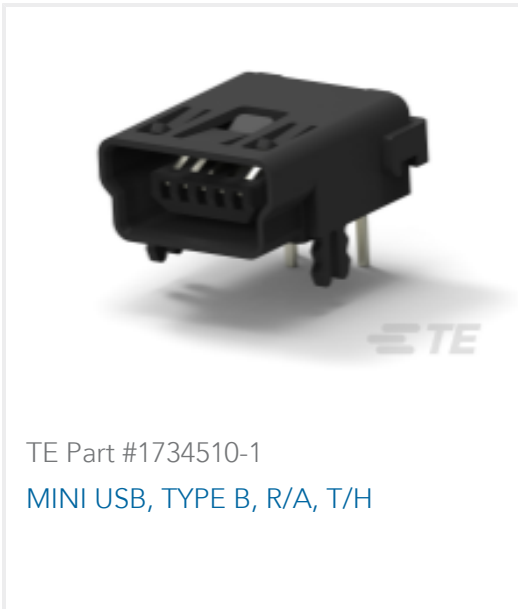
TE Part #1734510-1 MINI USB, TYPE B, R/A, T/H