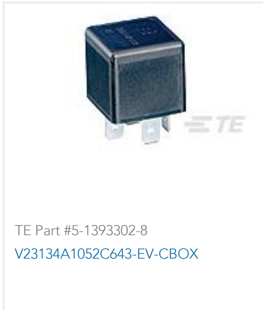
TE Part #5-1393302-8 V23134A1052C643-EV-CBOX