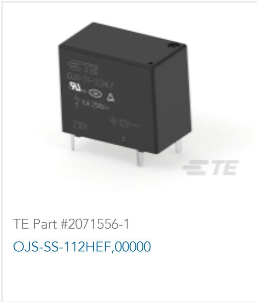
TE Part #2071556-1 OJS-SS-112HEF,00000