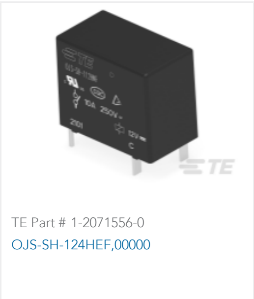
TE Part # 1-2071556-0 OJS-SH-124HEF,00000