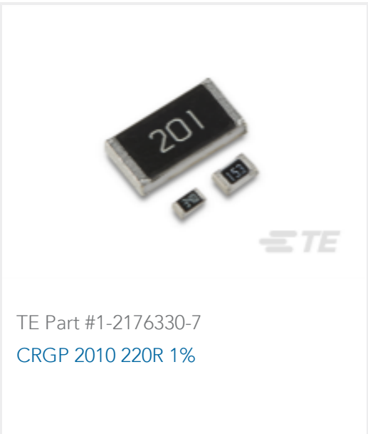
TE Part #1-2176330-7 CRGP 2010 220R 1%