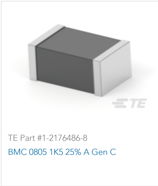
TE Part #1-2176486-8 BMC 0805 1K5 25% A Gen C