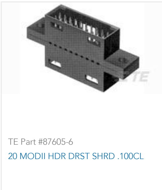
TE Part #87605-6 20 MODII HDR DRST SHRD .100CL