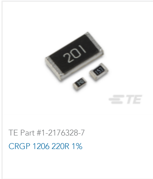
TE Part #1-2176328-7 CRGP 1206 220R 1% SMT