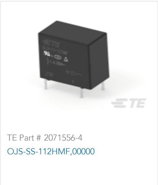
TE Part # 2071556-4 OJS-SS-112HMF,00000