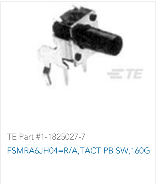
TE Part #1-1825027-7 FSMRA6JH04=R/A, TACT PB SW, 160G