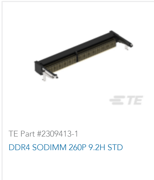
TE Part #2309413-1 DDR4 SODIMM 260P 9.2H STD