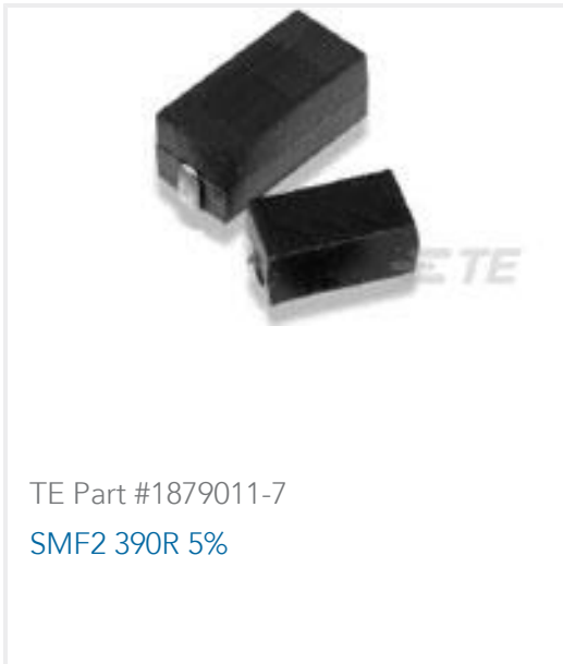
TE Part #1879011-7 SMF2 390R 5%