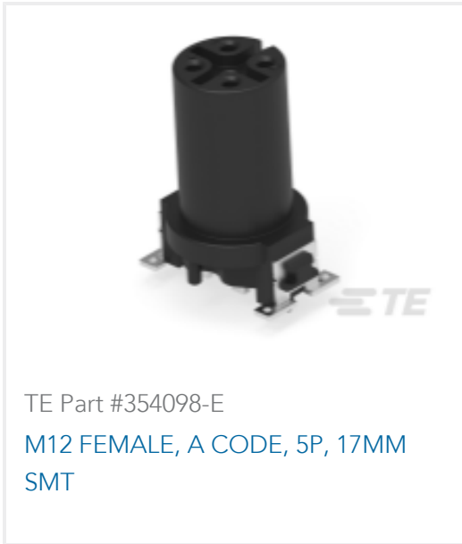
TE Part #354098-E M12 FEMALE, A CODE, 5P, 17MM SMT