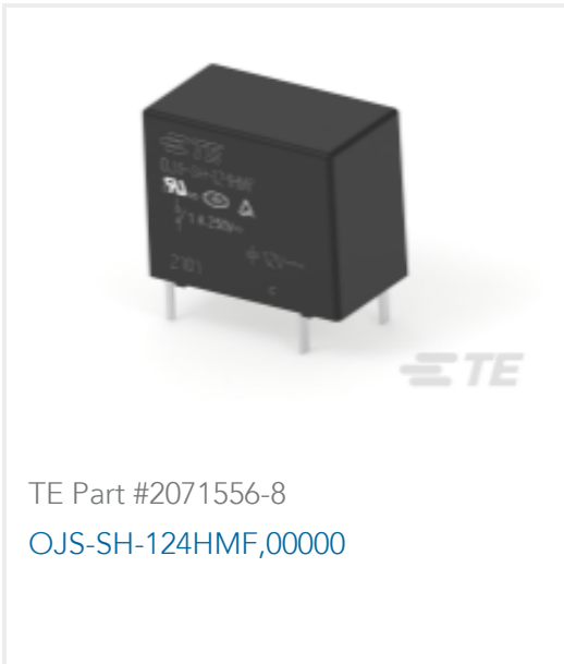
TE Part #2071556-8 OJS-SH-124HMF,00000