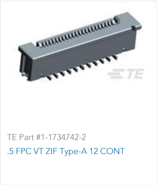
TE Part #1-1734742-2 .5 FPC VT ZIF Type-A 12 CONT