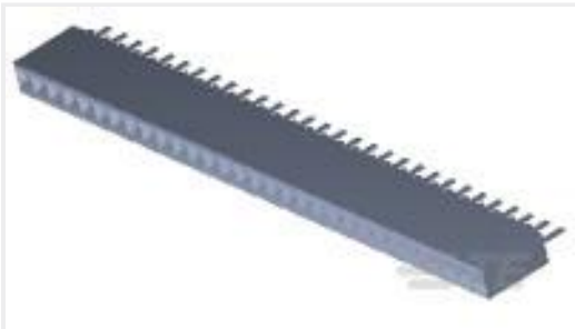
TE Part #2-534237-8 30 MODII VRT SR CE 100/115