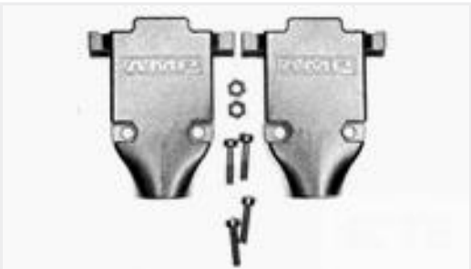
TE Part #5745173-1 CABLE CLAMP KIT,SZ 3