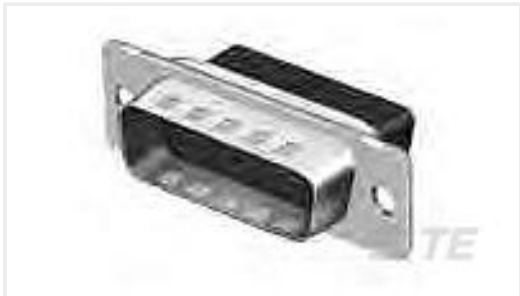
TE Part #205210-3 PLUG ASSY SIZE 4