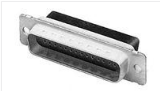
TE Part #748364-1 15 HD22 CRIMP SNAP PLUG