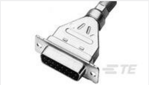
TE Part #5787908-1 KIT,RCPT,15P,HDP-20,SHLD HDWRE