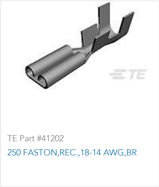
TE Part #41202 250 FASTON,REC.,18-14 AWG,BR