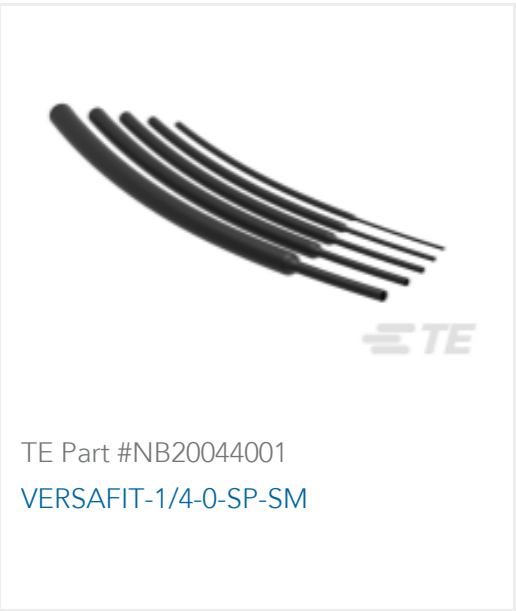
TE Part #NB20044001 VERSAFIT-1/4-0-SP-SM