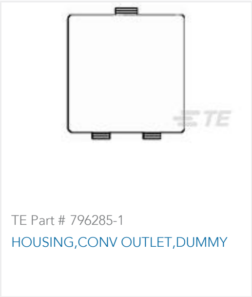
TE Part # 796285-1 HOUSING,CONV OUTLET,DUMMY