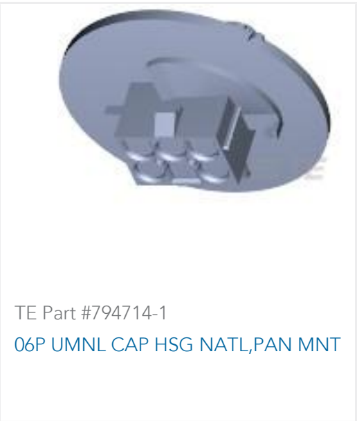
TE Part #794714-1 06P UMNL CAP HSG NATL,PAN MNT