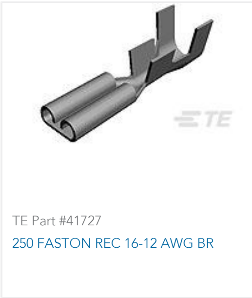
TE Part #41727 250 FASTON REC 16-12 AWG BR