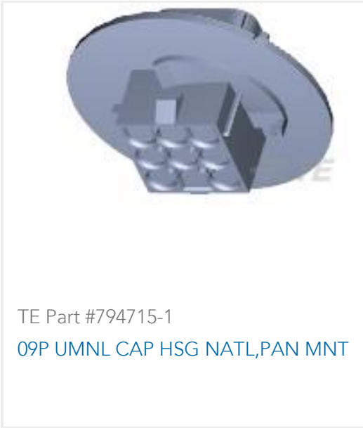
TE Part #794715-1 09P UMNL CAP HSG NATL,PAN MNT