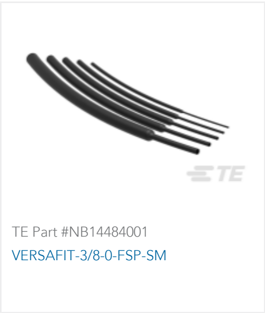
TE Part #NB14484001 VERSAFIT-3/8-0-FSP-SM