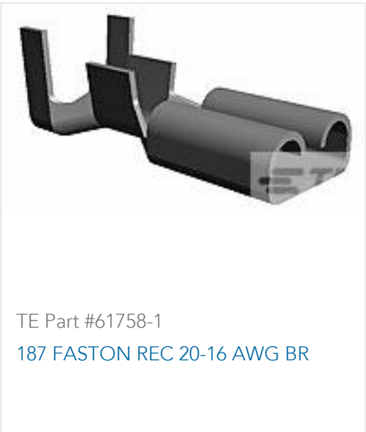
TE Part #61758-1 187 FASTON REC 20-16 AWG BR