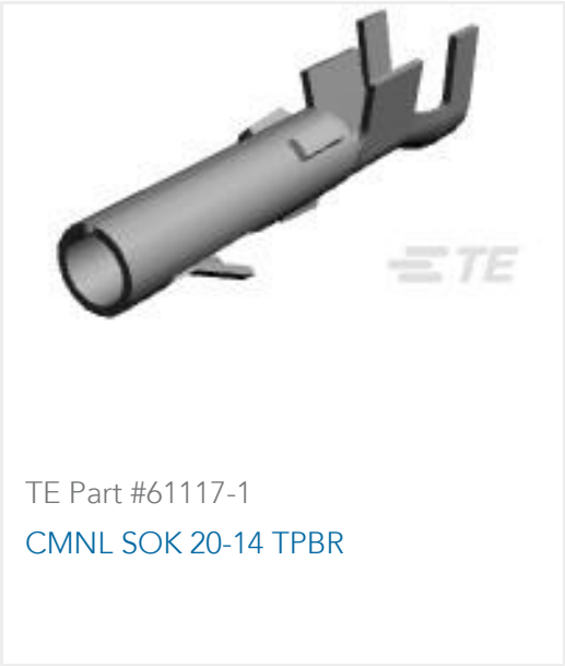
TE Part #61117-1 CMNL SOK 20-14 TPBR