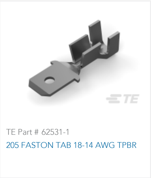
TE Part # 62531-1 205 FASTON TAB 18-14 AWG TPBR