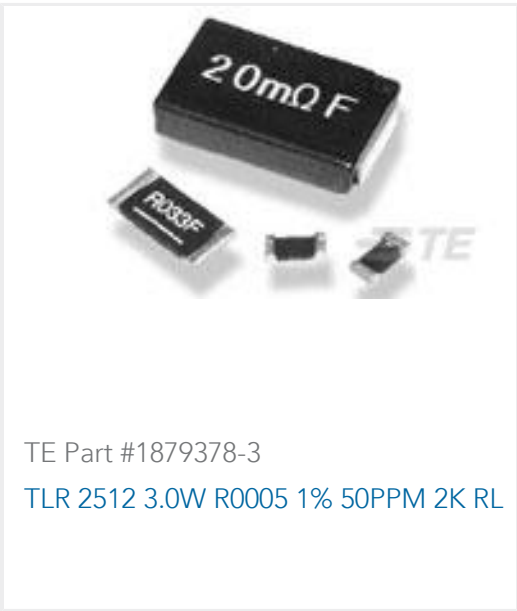
TE Part #1879378-3 TLR 2512 3.0W R0005 1% 50PPM 2K RL