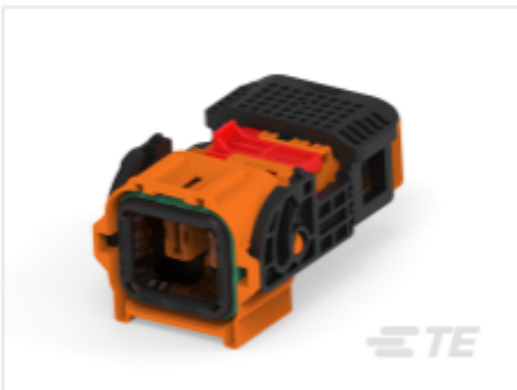
TE Part #2311753-1 2POS, PCON12, REC HSG ASSY, 180DEG, COD A

Product Drawings 4 bay mounting frame assembly English