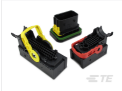
TE Part #CAT-L489-CH8172 LEAVYSEAL Connector Housings