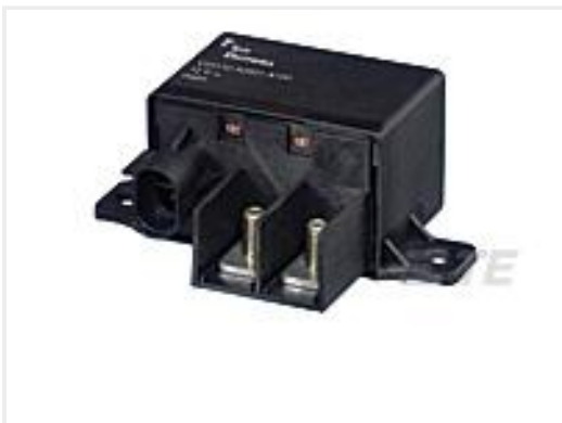
TE Part #1416010-1 V23132A2001B200