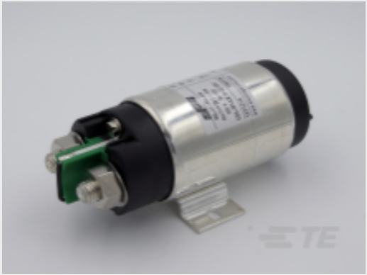
TE Part #K1060611 Relay 29-311-12A