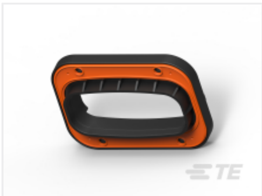
TE Part #2236721-1 ADAPTER, FOR TAB HOUSING, ASSY