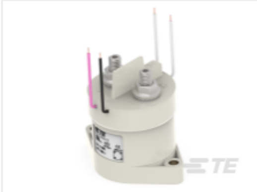
TE Part #2-2071567-1 ECK250HAAPA