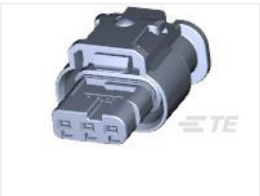
TE Part #1488991-6 3POS, MCON 1.2 CB REC 2p TL SEALED