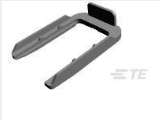
TE Part #1703804-1 SLIDE, FOR TAB HOUSING, 15POS.