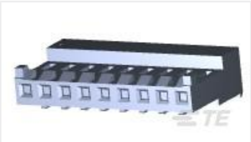
TE Part #3-643817-9 09P MTA156 CONN ASSY 18AWG LF