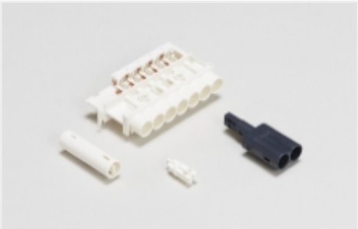
Plug & Socket Lighting Connectors(19)