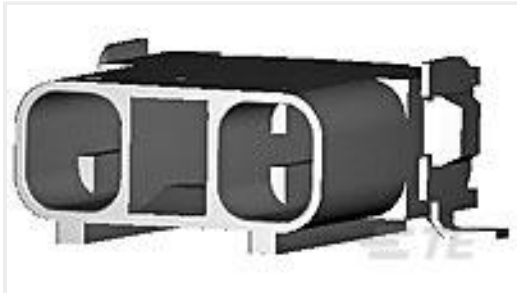
TE Part #2106056-2 Assembly, Right Angle SMT Header, 2-Posi