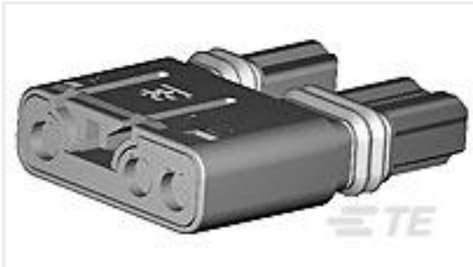
TE Part #2106135-3 Assembly, Plug, 3-Position