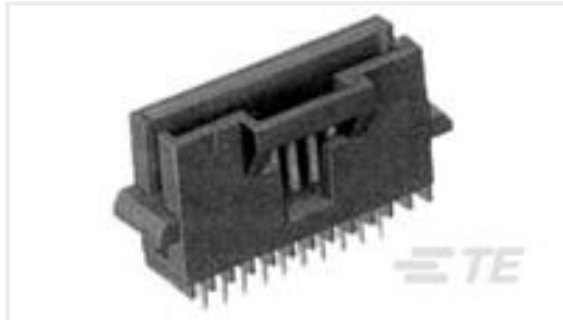
TE Part #5-104071-3 15 SYSTEM 50 HDR SRST SHRD SN