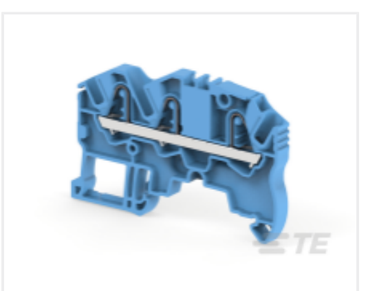
TE Part #1SNK705021R0000 ZK2.5-3P-BL