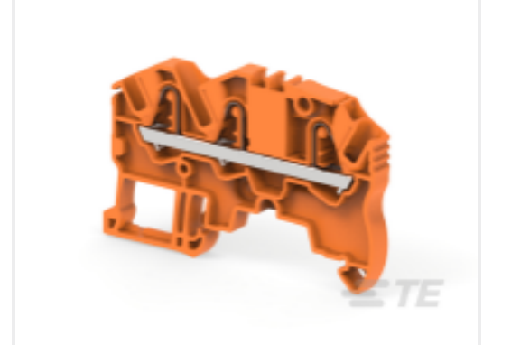
TE Part #1SNK705031R0000 ZK2.5-3P-OR