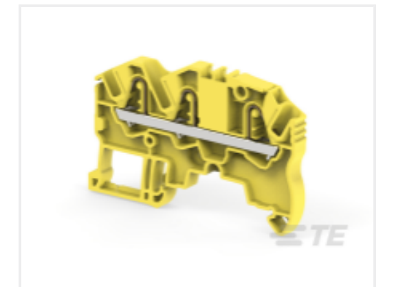
TE Part #1SNK705067R0000 ZK2.5-3P-YL