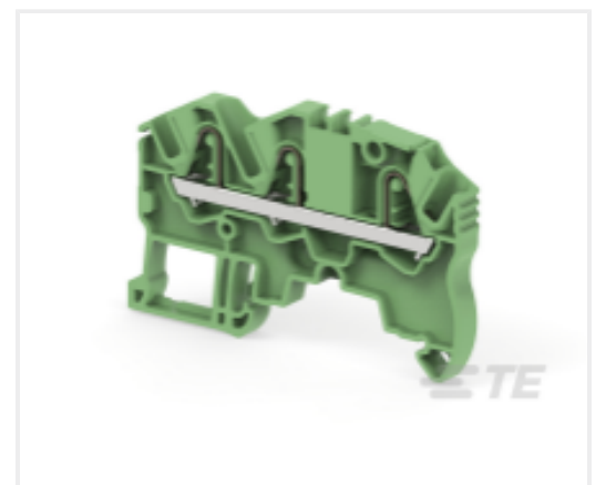
TE Part #1SNK705068R0000 ZK2.5-3P-GN