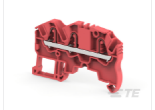
TE Part #1SNK705069R000 ZK2.5-3P-RD