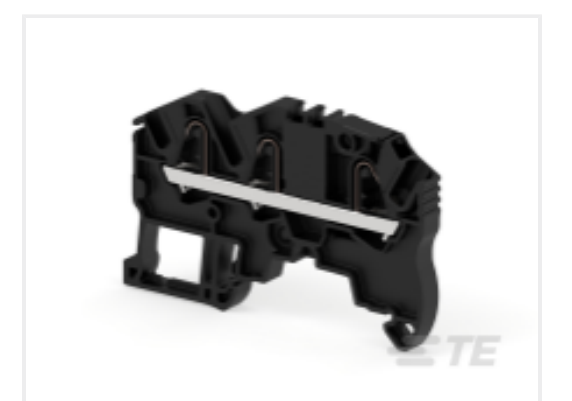
TE Part #1SNK705073R0000 ZK2.5-3P-BK