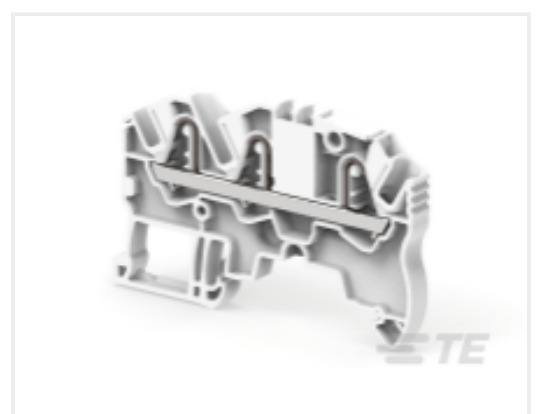
TE Part #1SNK705072R0000 ZK2.5-3P-WH