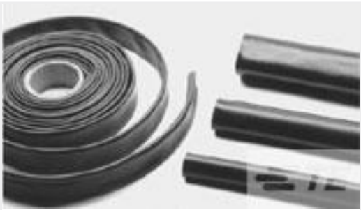
TE Part #CB5052-000 BSTS-17X4