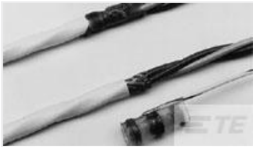
TE Part #A39093-000 B-155-11

CONTACT,Recept, SLC, Tin Plated, On Stip