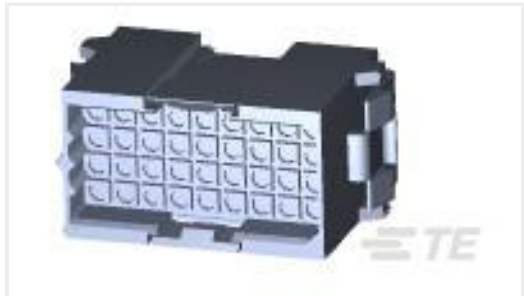
TE Part #207020-1 METRIMATE RCPT 36 POS