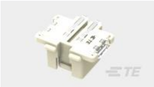
TE Part #2154829-1 High Power Inverted Thru Board Con 2 Pos