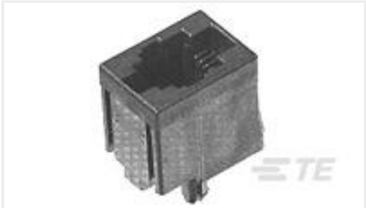
TE Part #5555799-1 MJ,TE,8P/8C,KEYED,TRAY PAC