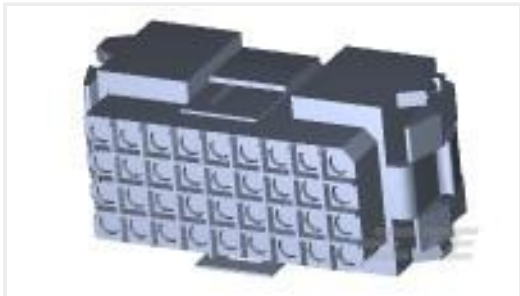
TE Part #207019-1 METRIMATE PLUG,36 POS