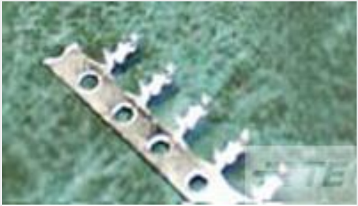
TE Part #440147-2 1.0 WTB Terminal 30u" Au