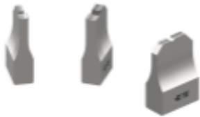
ANVIL REPRESENTATION ONLY