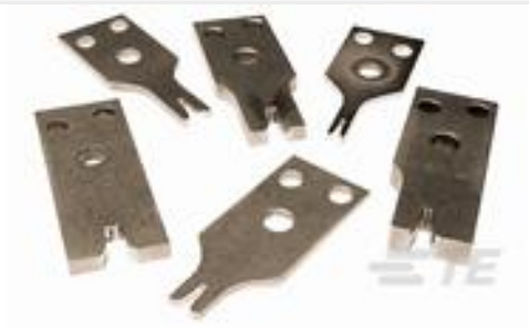
TE Part #2-1490019-3 CRIMPER, WIRE (.050" 'F')