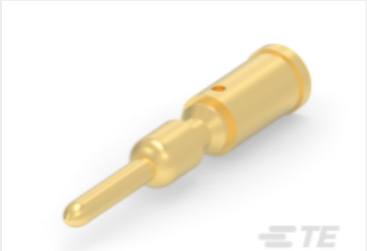
TE Part #61-0231-011-P00 CONTACT PIN 1 MM