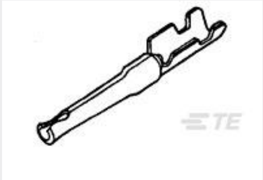
TE Part #1658686-1 SOCKET CONTACT,22 DF,STRIP,22-