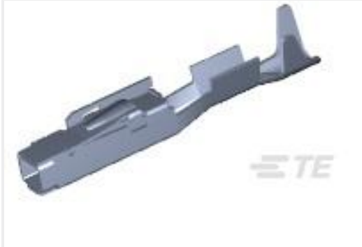
TE Part #7-1452656-2 MCON 1.2 LL REC SRC AU