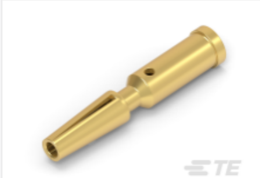
TE Part #60-0252-011-P00 CONTACT SOCKET 1 MM