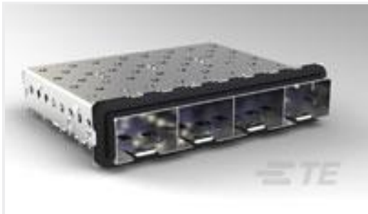
TE Part #2057162-1 SFP+ 1X4 Cage Assembly, PF, EF