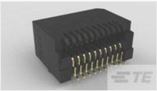
TE Part #1658197-1 SFP, 20 POSN, 0.8MM PITCH, SUR