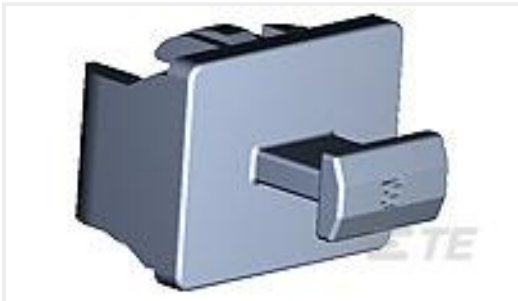
TE Part #1761394-1 DUST COVER, SFP, GANGED & STACKED