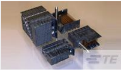
TE Part #2057430-3 IMP100S,H,V2P10C,UG,OEWS39,5.5