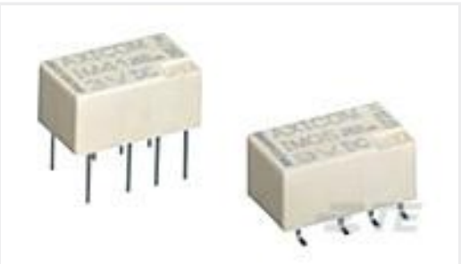
TE Part #5-1462037-3 IM41TS=IM RELAY 100mW 3V BIS