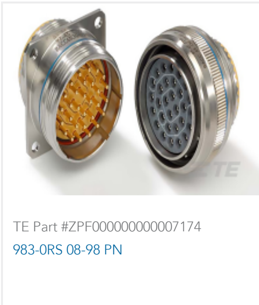
TE Part #ZPF0000000000007174 983-0RS 08-98 PN