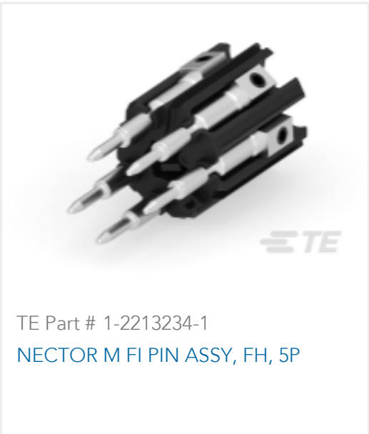
TE Part # 1-2213234-1 NECTOR M FI PIN ASSY, FH, 5P