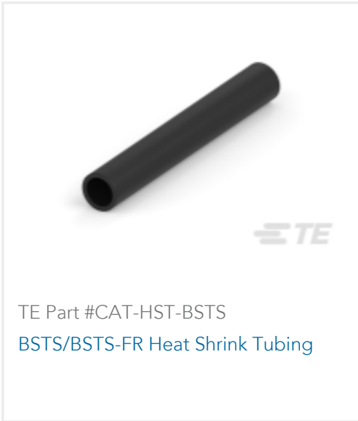
TE Part #CAT-HST-BSTS BSTS/BSTS-FR Heat Shrink Tubing