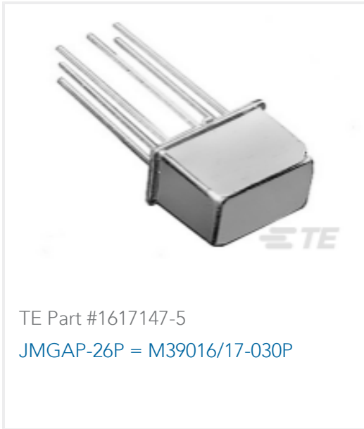
TE Part #1617147-5 JMGAP-26P = M39016/17-030P