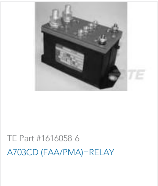
TE Part #1616058-6 A703CD (FAA/PMA)=RELAY