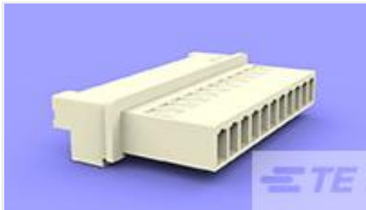
TE Part #1969589-3 HSG, REC, FREE-HANG, GWT, SINGLE ROW, EP2.5