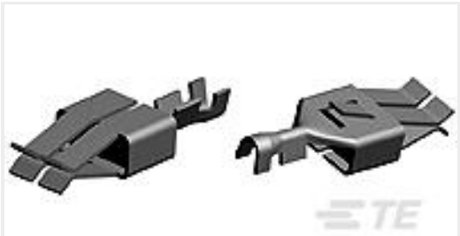
TE Part #925612-1 STC REC 6.3 Contact SRC Sn