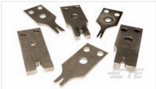
TE Part #3-456402-1 CRIMPER, WIRE .055 'F'