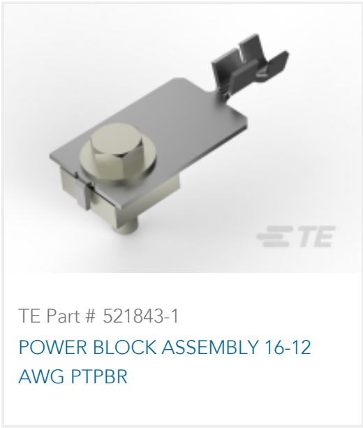
TE Part # 521843-1 POWER BLOCK ASSEMBLY 16-12 AWG PTPBR