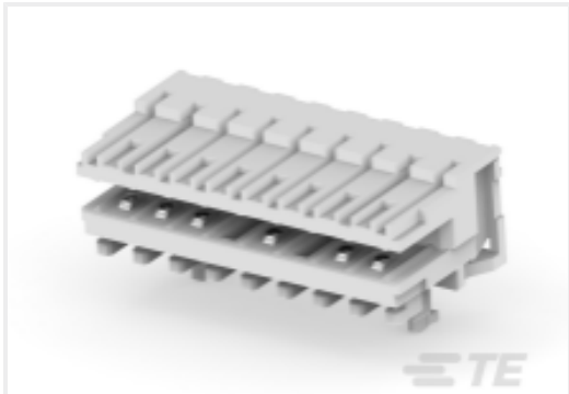
TE Part #2-1534798-8 DUOPLUG MK II CONNECTOR 3-20P SELEK LOAD