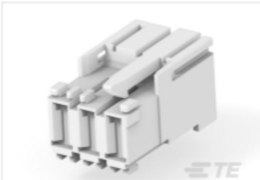
TE Part #1-1534073-3 MULTIFIT MK2 ASSY3P