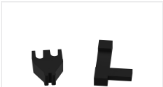
TE Part #1-1976055-3 STANDOFF, HOLD-DOWN