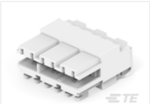
TE Part #7-1740533-3 AMP DUOPLUG POW CONN. 3POS W.PCB LOCKING