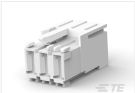
TE Part #1534073-3 MULTIFIT MK2 ASSY3P