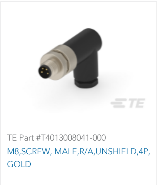
TE Part #T4013008041-000 M8,SCREW, MALE,R/A,UNSHIELD,4P, GOLD