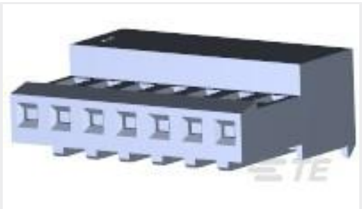
TE Part #3-640440-7 07P MTA100 CONN ASSY 22AWG RED