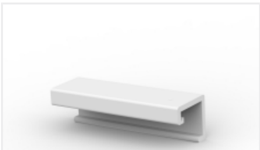
TE Part #CAT-104MTA-PLSCC Polyester PCB Connector Covers: 2.54 mm, MTA 100