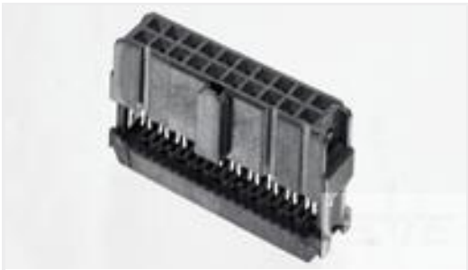
TE Part #1658622-4 20 NOVO MIL/CTR 30DP,LEAD FREE