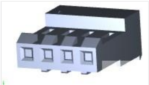
TE Part #3-640426-4 04P MTA156 CONN ASSY 18AWG ORA