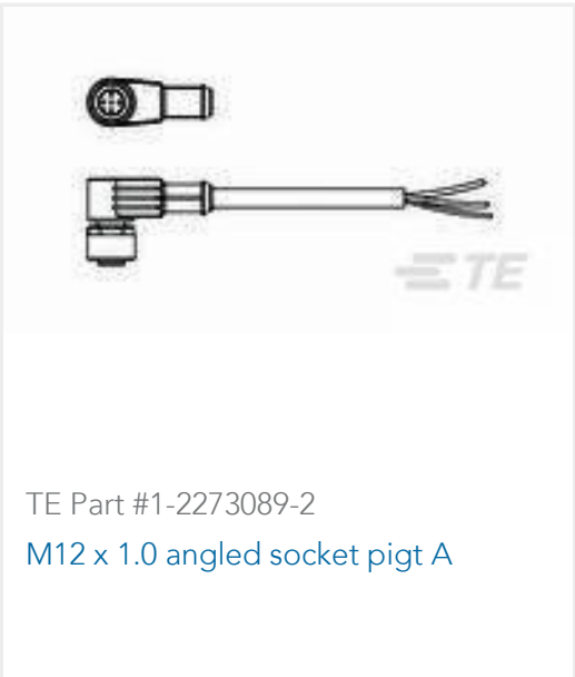
TE Part #1-2273089-2 M12 x 1.0 angled socket pigt A