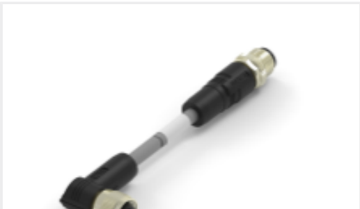
TE Part #TAA756A1611-020 M12A5-MS-FR-PVC-2.0M