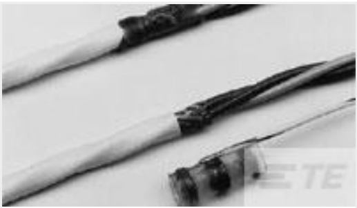
TE Part #694681-000 CWT-3807-W2