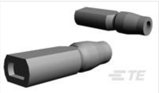
TE Part #170823-4 250 FASTON SLEEVE, REC., TRANSPARENT