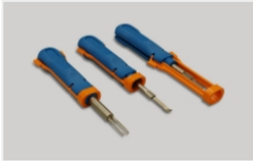
Insertion & Extraction Tools(2)