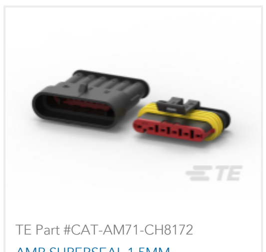
AMP SUPERSEAL 1.5MM, CONNECTOR HOUSING