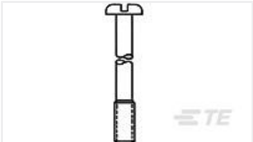
TE Part #5229911-1 SCREW,PAN HD,"CHAMP PACKAGING