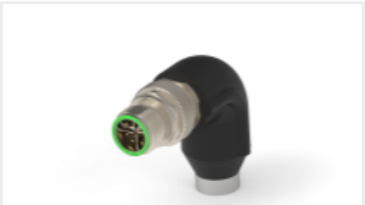
TE Part #2350791-2 M12 X-M-8,90,CRIMP,CAT7,TE 2297799-1