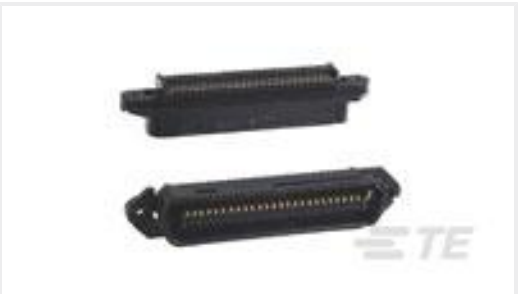
TE Part #229974-1 ASSY, PLUG, 50 POS, B SLOT