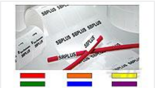
TE Part #CN9930-000 SBP190319WE2.5