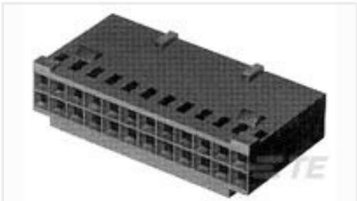
TE Part #1-87631-5 20 MODIV HSG COMP DR .100 POL