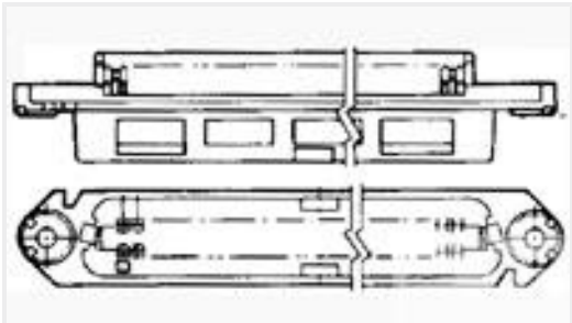
TE Part #229975-1 ASSY,RCPT,50POS,B SLOT,BLK HSG