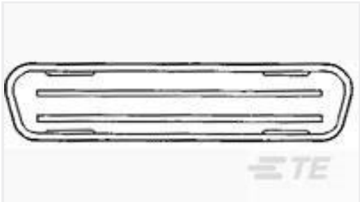
TE Part #229969-1 COVER,DUST,RCPT,RED,CHAMP