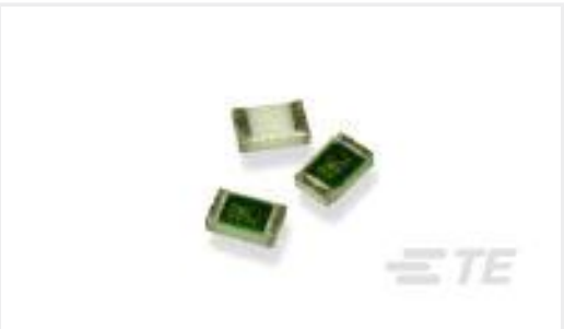
TE Part #6-1879208-8 CPF 0402 6K2 0.1% 25PPM 1K RL