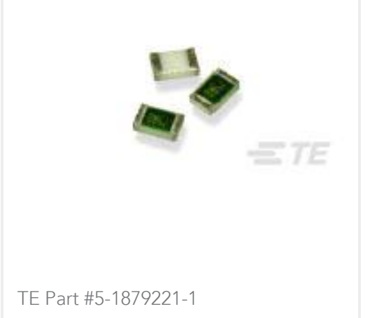
CPF 0603 4R99 0.1% 25PPM 1K RL