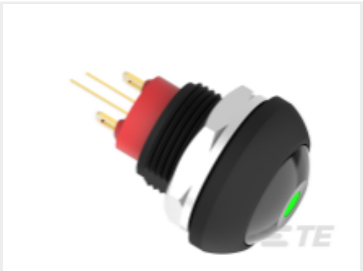
TE Part # 2329387-4 PB OFF/ON FC BLK M1 TERM GRE LED IP68