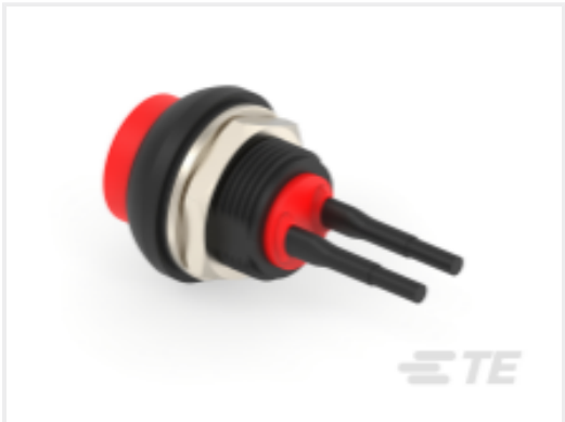
TE Part # 2329359-2 PN OFF/ON HC RED M1 TERM IP68 500MM LHS