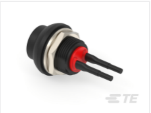
TE Part # 2329359-1 PN OFF/ON HC BLK M1 TERM IP68 500MM LHS