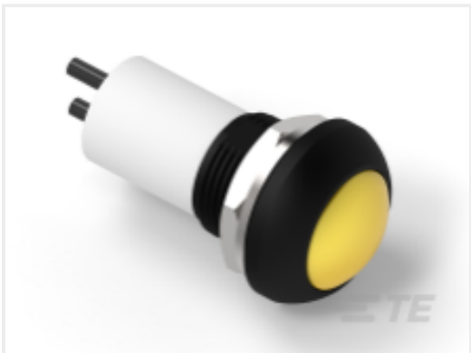
TE Part # 2329361-3 PB OFF/ON RC YLW M1 TERM IP68 500MM L