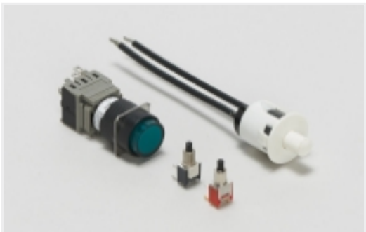
Push Button Switches(30)