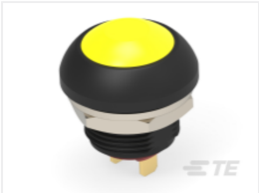
TE Part # 2329383-3 PB OFF/ON FC YLW M1 TERM. IP68

This information is provided based on reasonable inquiry of our suppliers and represents our current actual knowledge based on the information they provided. This information is subject to change. The part numbers that TE has identified as EU RoHS compliant have a maximum concentration of 0.1% by weight in homogenous materials for lead, hexavalent chromium, mercury, PBB, PBDE, DBP, BBP, DEHP, DIBP, and 0.01% for cadmium, or qualify for an exemption to these limits as defined in the Annexes of Directive 2011/65/EU (RoHS2). Finished electrical and electronic equipment products will be CE marked as required by Directive 2011/65/EU. Components may not be CE marked. Additionally, the part numbers that TE has identified as EU ELV compliant have a maximum concentration of 0.1% by weight in homogenous materials for lead, hexavalent chromium, and mercury, and 0.01% for cadmium, or qualify for an exemption to these limits as defined in the Annexes of Directive 2000/53/EC (ELV). Regarding the REACH Regulation, the information TE provides on SVHC in articles for this part number is based on the latest European Chemicals Agency (ECHA) 'Guidance on requirements for substances in articles' posted at this URL: https://echa.europa.eu/guidance-documents/guidance-on-reach