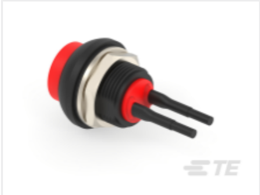
TE Part # 2329359-2 PN OFF/ON HC RED M1 TERM IP68 500MM LHS