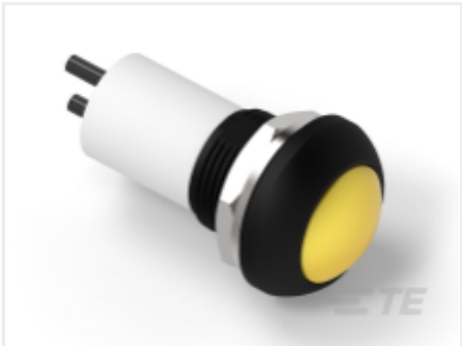
TE Part # 2329361-3 PB OFF/ON RC YLW M1 TERM IP68 500MM L

This information is provided based on reasonable inquiry of our suppliers and represents our current actual knowledge based on the information they provided. This information is subject to change. The part numbers that TE has identified as EU RoHS compliant have a maximum concentration of 0.1% by weight in homogenous materials for lead, hexavalent chromium, mercury, PBB, PBDE, DBP, BBP, DEHP, DIBP, and 0.01% for cadmium, or qualify for an exemption to these limits as defined in the Annexes of Directive 2011/65/EU (RoHS2). Finished electrical and electronic equipment products will be CE marked as required by Directive 2011/65/EU. Components may not be CE marked. Additionally, the part numbers that TE has identified as EU ELV compliant have a maximum concentration of 0.1% by weight in homogenous materials for lead, hexavalent chromium, and mercury, and 0.01% for cadmium, or qualify for an exemption to these limits as defined in the Annexes of Directive 2000/53/EC (ELV). Regarding the REACH Regulation, the information TE provides on SVHC in articles for this part number is based on the latest European Chemicals Agency (ECHA) ‘Guidance on requirements for substances in articles’ posted at this URL: https://echa.europa.eu/guidance-documents/guidance-on-reach