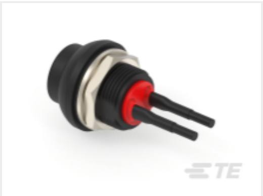
TE Part # 2329359-1 PN OFF/ON HC BLK M1 TERM IP68 500MM LHS