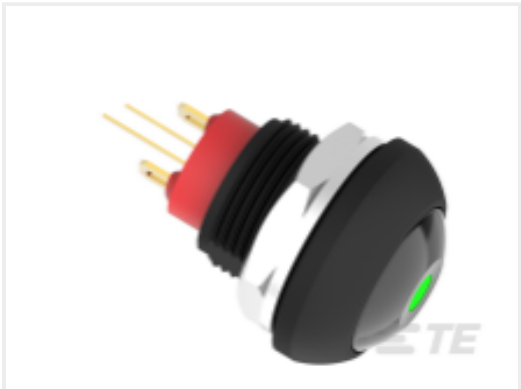
TE Part # 2329387-4 PB OFF/ON FC BLK M1 TERM GRE LED IP68