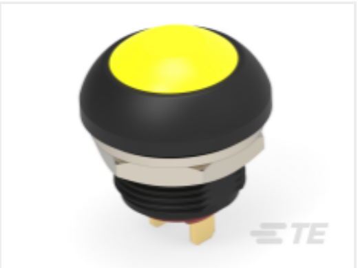
TE Part # 2329383-3 PB OFF/ON FC YLW M1 TERM. IP68