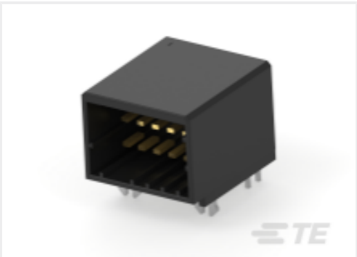
TE Part #CAT-D9934-A66B Header Assembly: Wire-to-Board, 5A, gold plated