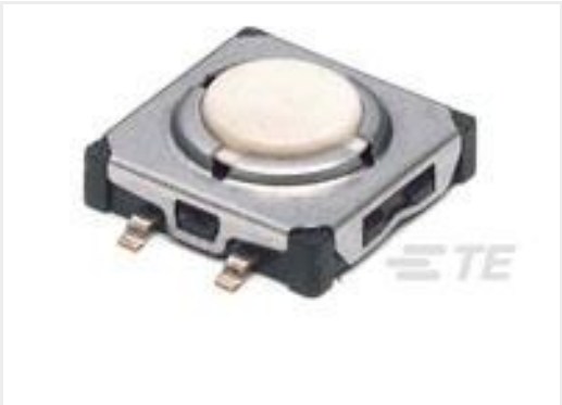
TE Part #1571218-3 TACT,SMT,12X12,SEALED,T&R