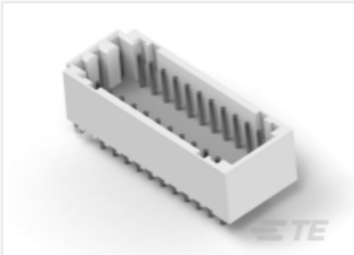
TE Part #CAT-3980700-DRWBVS CT 2mm Dbl Row Assembly w/Boss: Vert.