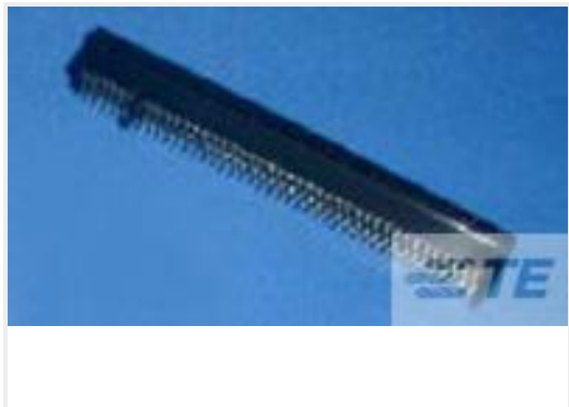
TE Part #5145154-4 STANDARD EDGE .050 SERIES 60 DUAL ASSY