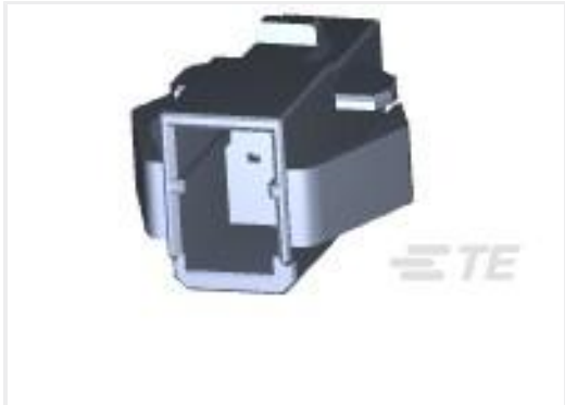
TE Part #1-1903131-2 DYNAMIC 1200D TAB HSG 4P P/M