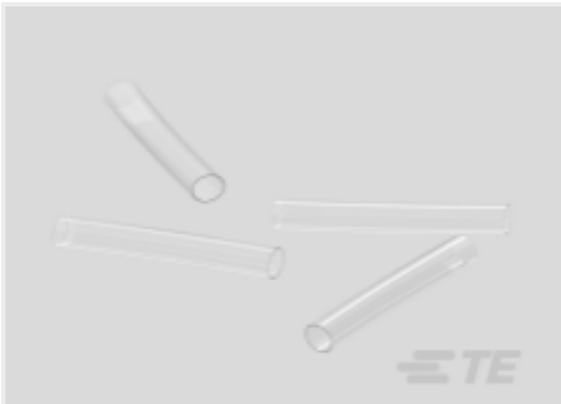
TE Part #NB26672001 TFER-5/8-X-STK