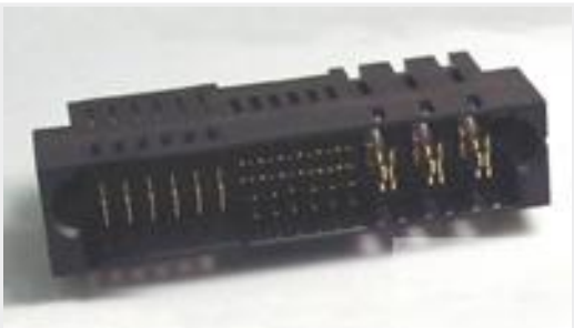
TE Part #6450842-2 MBXLE R/A HEADER 3ACP8P24S