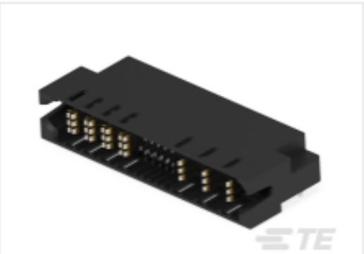
TE Part #2391130-4 MB Lite,R/A,HDR,SOLDER, 4P+25S+3LP