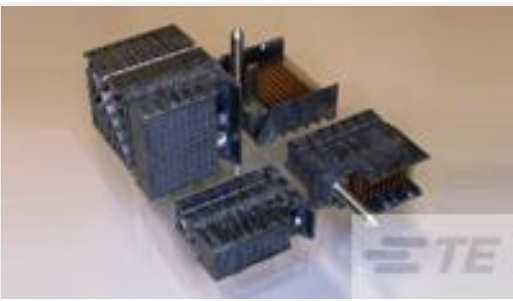
TE Part #2007808-2 IMP100S,H,V4P10C,LG,OEW46,4.9