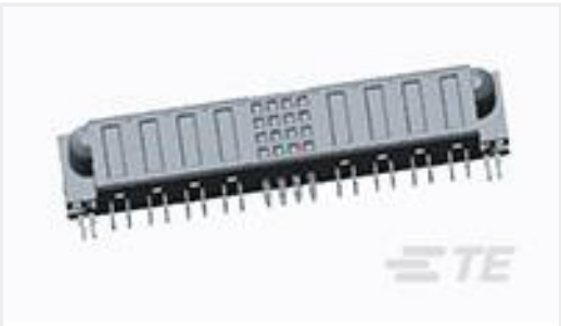
TE Part #2-6450880-4 MBXLE R/A RCPT 4P16S4P