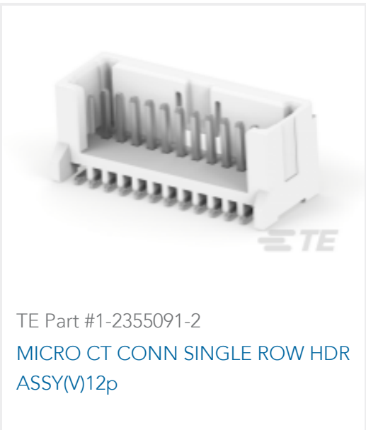
TE Part #1-2355091-2 MICRO CT CONN SINGLE ROW HDR ASSY(V)12p