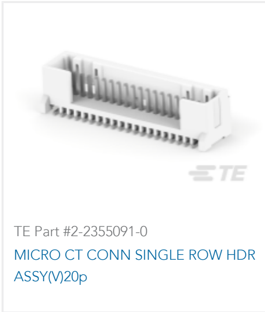
TE Part #2-2355091-0 MICRO CT CONN SINGLE ROW HDR ASSY(V)20p