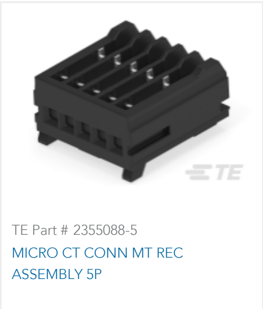
TE Part # 2355088-5 MICRO CT CONN MT REC ASSEMBLY 5P