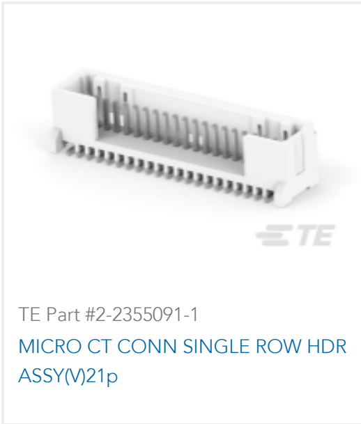
TE Part #2-2355091-1 MICRO CT CONN SINGLE ROW HDR ASSY(V)21p