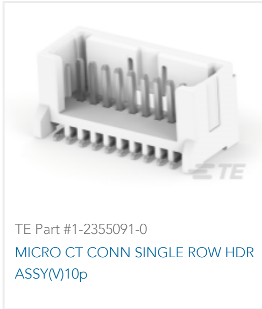
TE Part #1-2355091-0 MICRO CT CONN SINGLE ROW HDR ASSY(V)10p