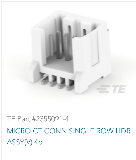
TE Part #2355091-4 MICRO CT CONN SINGLE ROW HDR ASSY(V) 4p