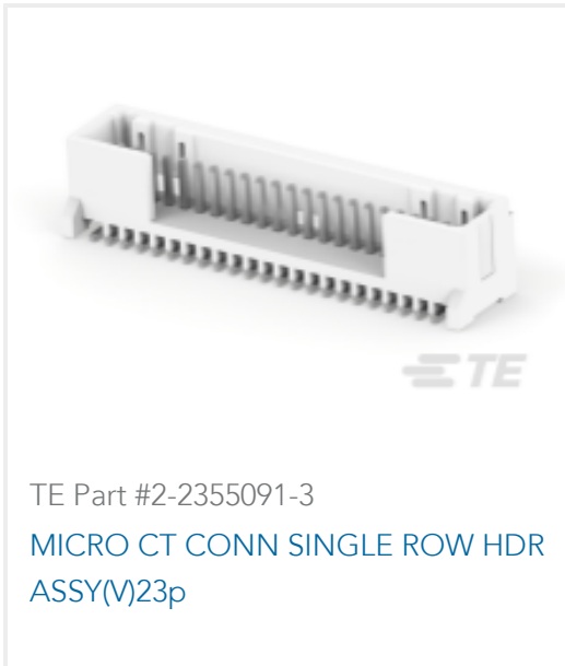
TE Part #2-2355091-3 MICRO CT CONN SINGLE ROW HDR ASSY(V)23p