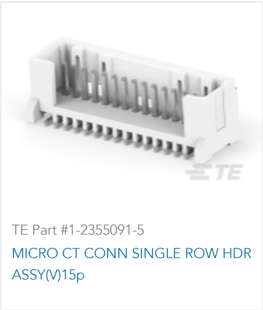
TE Part #1-2355091-5 MICRO CT CONN SINGLE ROW HDR ASSY(V)15p