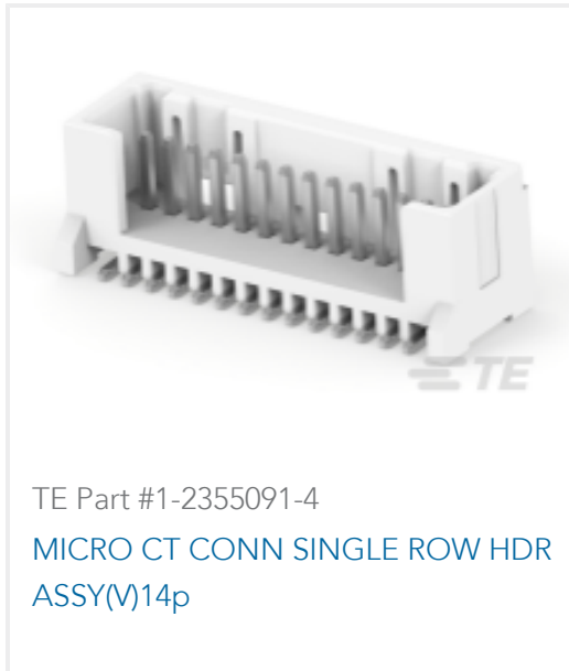
TE Part #1-2355091-4 MICRO CT CONN SINGLE ROW HDR ASSY(V)14p