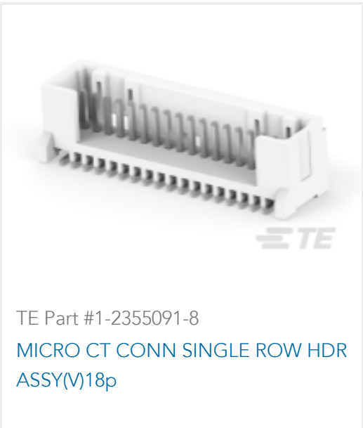
TE Part #1-2355091-8 MICRO CT CONN SINGLE ROW HDR ASSY(V)18p