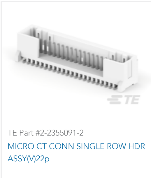
TE Part #2-2355091-2 MICRO CT CONN SINGLE ROW HDR ASSY(V)22p