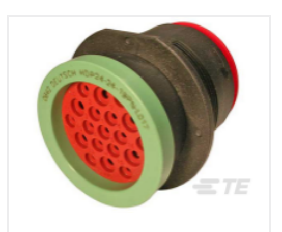
TE Part #HDP24-24-19PN-L017 REC, 19P, BLK, N, RNG, 12/16, P