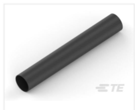
TE Part #NB10746001 ATUM-32/8-0-85MM