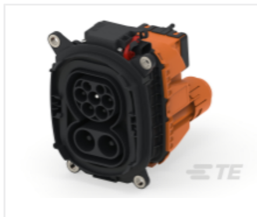
TE Part # CAT-AQ6-HPCI High-Power Charging CCS1 and CCS2 Inlet Kits