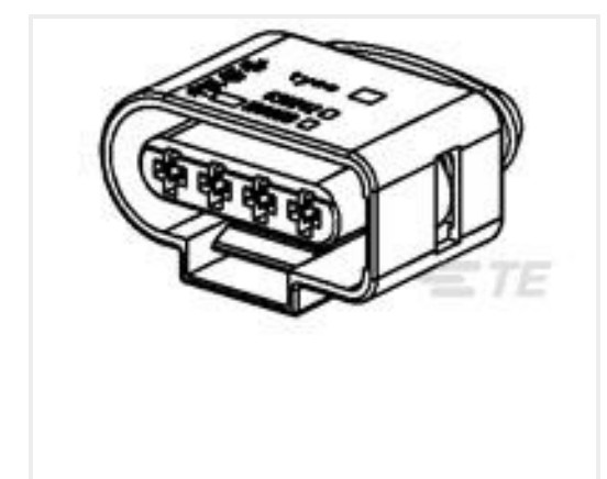
TE Part #638245-1 RECEPTACLE ASSY,4P SEALED,JPT