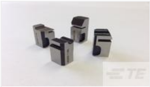
TE Part #462006-6 FLOATING SHEAR