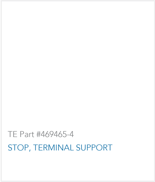
TE Part #469465-4 STOP, TERMINAL SUPPORT