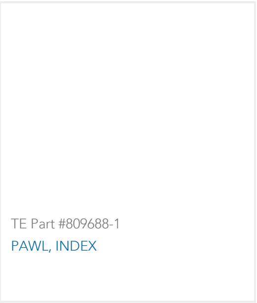
TE Part #809688-1 PAWL, INDEX