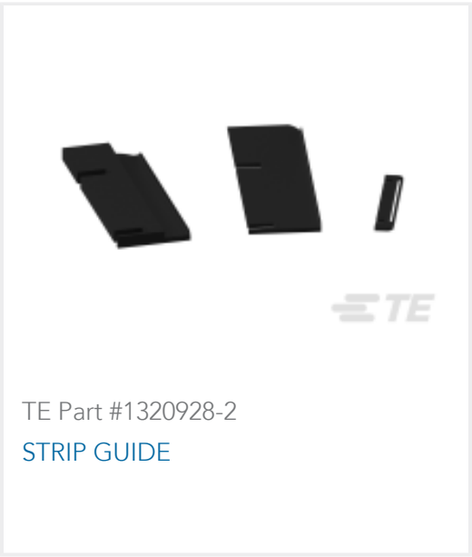
TE Part #1320928-2 STRIP GUIDE