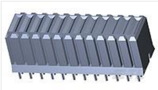
TE Part #5223995-2 UPM EXPANDED RECEPTACLE ASSEMB