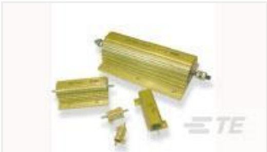
TE Part #3-1630027-0 HSC300 3R2 5%