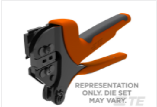
TE Part #2381460-1 SDE F DYNAMIC D2000 22-18AWG ASSY