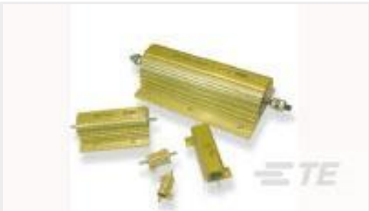
TE Part #7-1625999-5 HSC100 8R0 5%