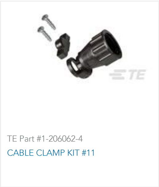
TE Part #1-206062-4 CABLE CLAMP KIT #11