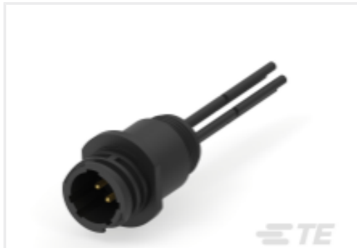
TE Part #2386899-1 HNG RCPT CONN CA,STD,SER 1,SZ 11-4,0.5 M