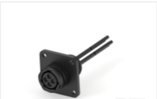
TE Part #2386908-1 SQ.FL RCPT CONN CA, REV,SER1, SZ11-4,0.5M