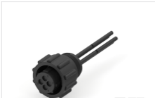
TE Part #2386907-1 PLUG CONN CA,STD,SER 1,SZ11-4, LGTH 0.5 M

Product Drawings LUG CONN CA,REV,SER 1,SZ 11-4,LGTH 0.5 M English