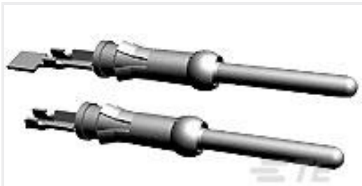
TE Part #1-66099-5 III+ PIN,18-16,TIN ,LP