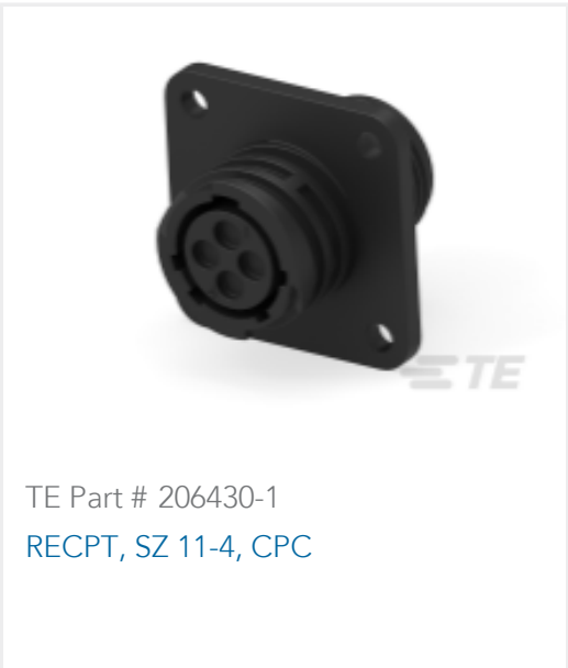
TE Part # 206430-1 RECPT, SZ 11-4, CPC