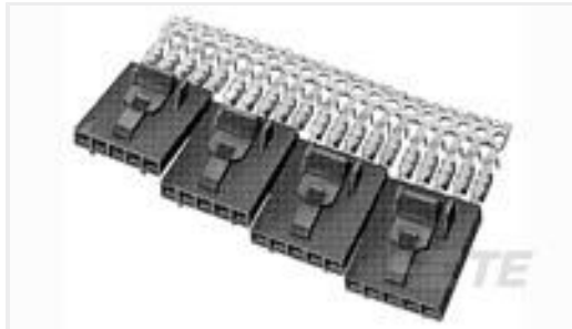
TE Part #6-103958-0 2X11 MTE RCPT SR LATCH .100CL