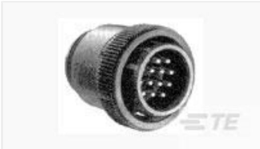
TE Part #206429-1 CPC PLUG ASSY, 11-4, REV SEX