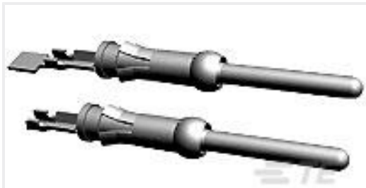
TE Part #66103-3 III+ PIN,24-20,15AU/FL,LP