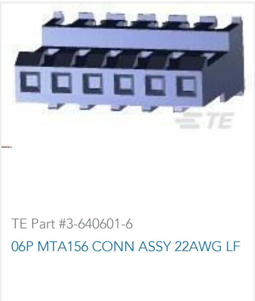
TE Part #3-640601-6 06P MTA156 CONN ASSY 22AWG LF