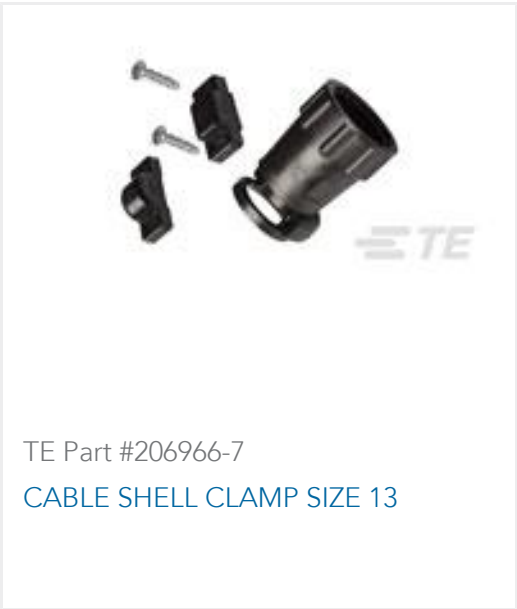
TE Part #206966-7 CABLE SHELL CLAMP SIZE 13