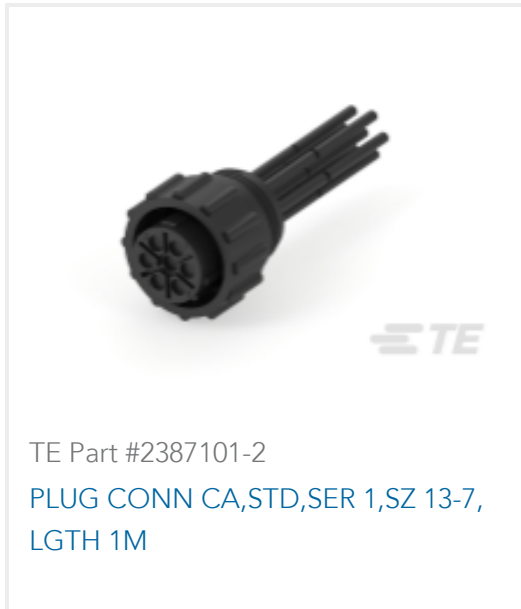
TE Part #2387101-2 PLUG CONN CA,STD,SER 1,SZ 13-7, LGTH 1M