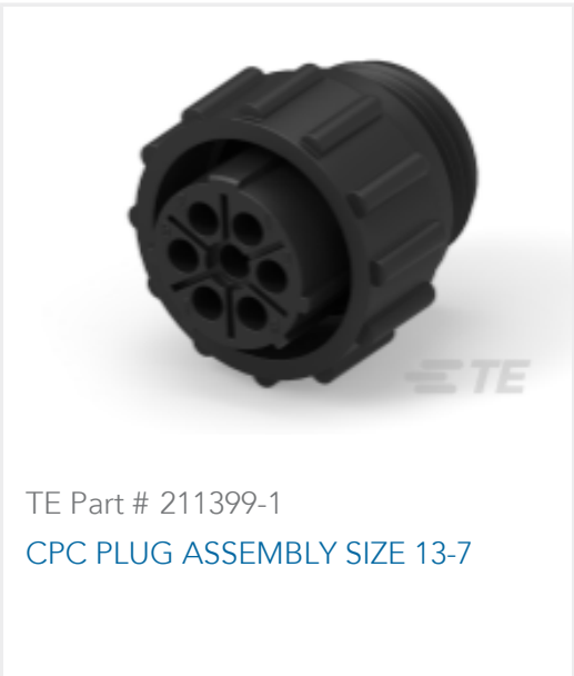
TE Part # 211399-1 CPC PLUG ASSEMBLY SIZE 13-7