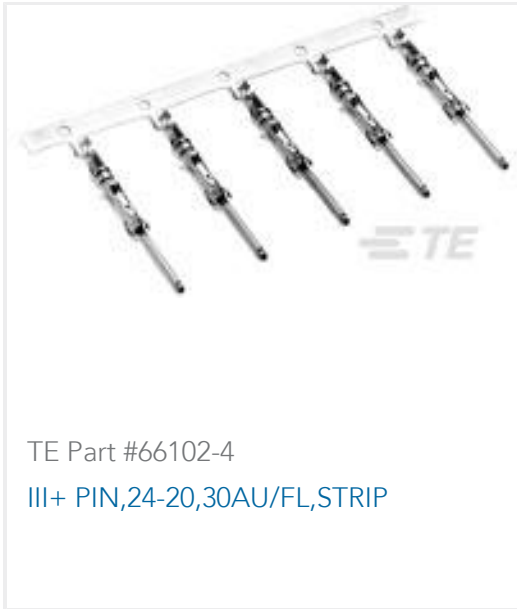
TE Part #66102-4 III+ PIN,24-20,30AU/FL,STRIP