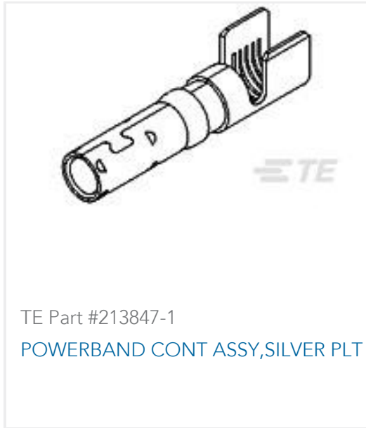
TE Part #213847-1 POWERBAND CONT ASSY,SILVER PLT