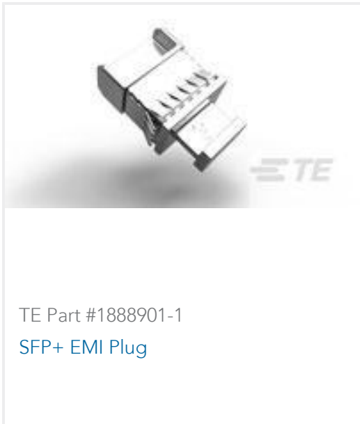
TE Part #1888901-1 SFP+ EMI Plug