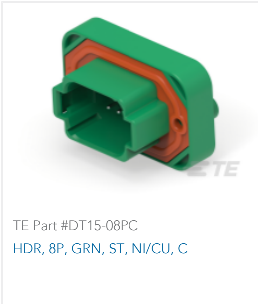
TE Part #DT15-08PC HDR, 8P, GRN, ST, NI/CU, C