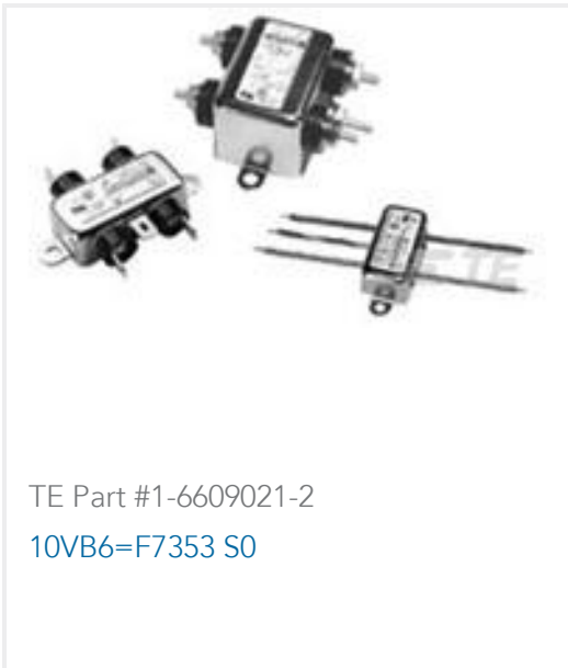
TE Part #1-6609021-2 10VB6=F7353 S0