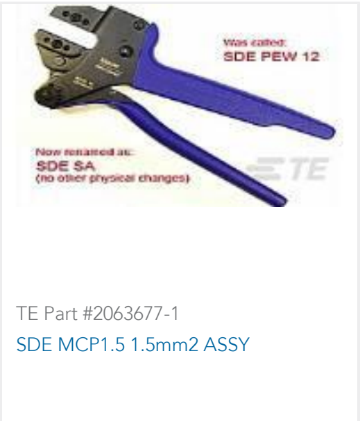
TE Part #2063677-1 SDE MCP1.5 1.5mm2 ASSY