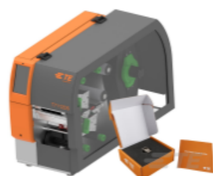
TE Part #1-2186577-1 T7112DS-SWARE-PRINTER