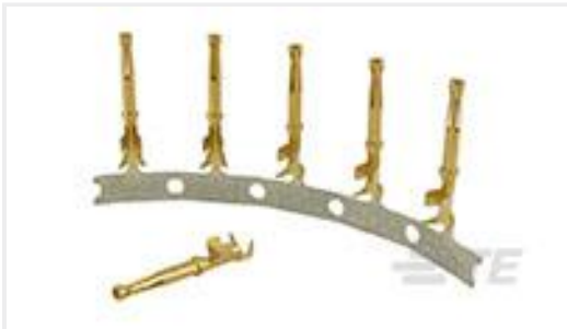
TE Part #1062-20-0344 SOC, SF, SIZE 20, 16-22, SLEVELESS, AU /SN