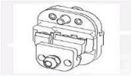
TE Part #2063041-2 SDE MQS 0.25-0.5mm2 DIE SET