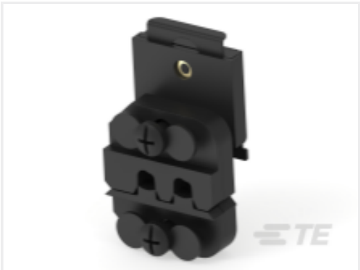
TE Part #2395362-2 SDE F NANOMQS 24-22 DIE SET