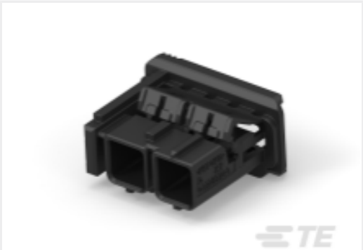
TE Part #2305974-1 2-PORT MATENET FRAME,UTP, COD A