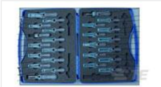
TE Part #4-1579010-0 EXTRACTION TOOL KIT