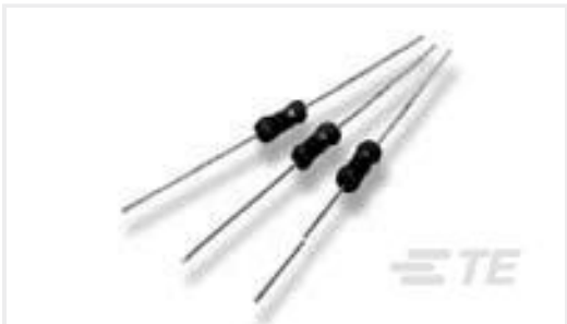
TE Part #2-1625890-9 2W SM M/OX 5% 1R8