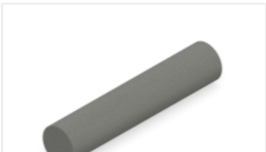
TE Part #2452641-1 SNA Cord 1.6mm x 10m L