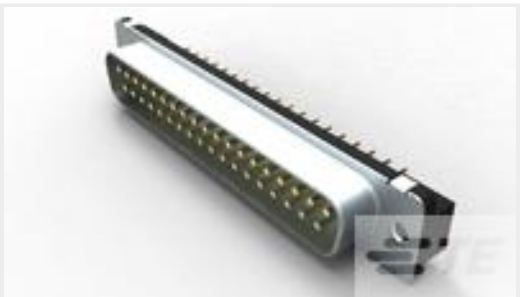
TE Part #5747375-8 37 PLUG SP/FMS INSRT