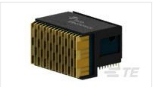
TE Part #2102771-2 Plug Assy, R Angle, 7Row, Cnt, MG, RUG