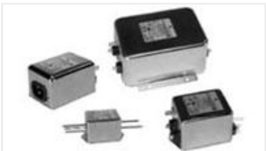
TE Part #6609053-5 6EHT1=F7664 S0