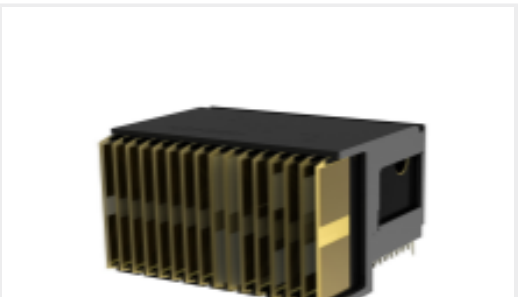
TE Part #2286250-1 MULTIGIG RT 2-R. 7RW