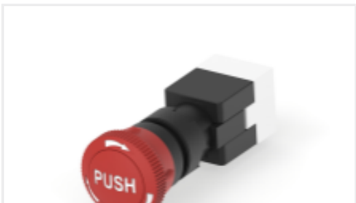
TE Part #2381881-2 PBES16 23.8 RB NO LAMP 1NC 1NO