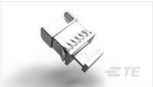
TE Part #1888901-1 SFP+ EMI Plug