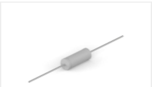
TE Part #1-2176412-0 5W XSM M/OX 5% 12R