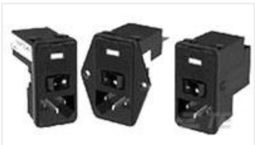
TE Part #7-6609107-3 PS0S0SS3A=C1186